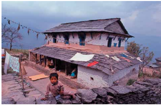
Left Nepal: the main material used for the houses in the Nepalese mountain village Dhampus, is slate. It is used in partially white-washed walls and for the roofs. Windows, supports and roof brackets are made of carved wood.