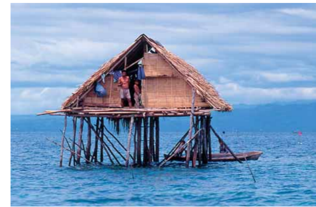
Left Indonesia: The houses of the Baju on the coast of the island Sulawesi are made of mangroves. The roofs are covered with palm leaves. The people live from the cultivation and sale of sea algae.