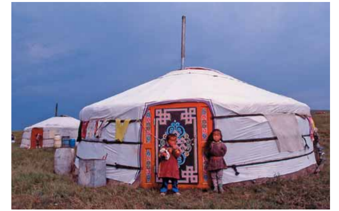
Opposite Mongolia: in Mongolia, the yurts are called 'gers'. Felt covers on an artistically decorated wood construction protect the interior against the weather. The ring-shaped opening of the single-family tent remains open for ventilation and acts as a natural source of light.

of both animals having similar wants, and possessing similar powers of reasoning." Untamed apes do not share man's urge to seek shelter in a natural cave, or under an overhanging rock, but prefer an airy scaffolding of their own making. At another point in The Descent of Man , Darwin writes that "the orang is known to cover itself at night with the leaves of the Pandanus"; and Brehm noted that one of his baboons "used to protect itself from the heat of the sun by throwing a straw-mat over his head. In these habits," he conjectured, "we probably see the first steps towards some of the simpler arts, such as rude architecture and dress, as they arise among the early progenitors of man." Suburban man falling asleep near his lawn mower, pulling a section of his Sunday paper over his head, thus re-enacts the birth of architecture.